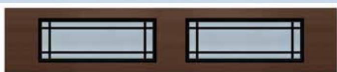
Satin Texture Glass & Regal Wide Black Muntin Bars