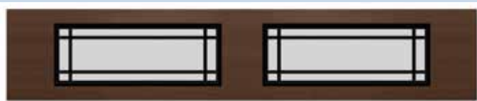
Regal Wide Black Muntin Bars