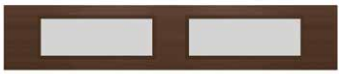
Clear View Sealed Glass