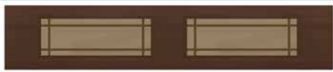
Bronze Tint Glass & Regal Wide Bronze Muntin Bars