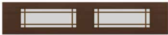
Regal Wide Bronze Muntin Bars