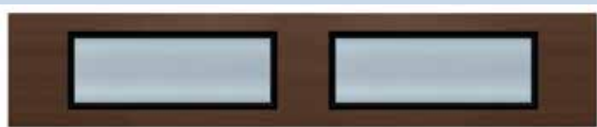
Satin Texture Sealed Glass